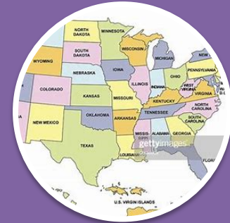
State and local races

35 of the 100 seats in the United States Senate will be contested.